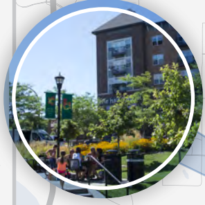
1. Lake Street draft concept 2. Penn American Development 3. Best Buy Headquarters at 76th 4. Heart of the City, Burnsville