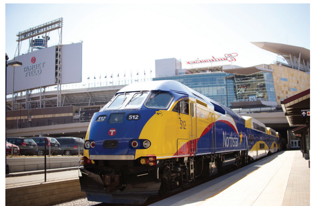
Northstar train at Target Field multimodal station.

Source: Metropolitan Council 2016 Population and Household Estimates