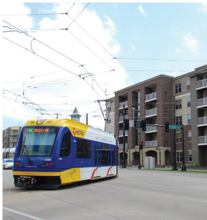
M Flat Condos: Located at 2900 University Avenue SE, adjacent to the Prospect Park Station