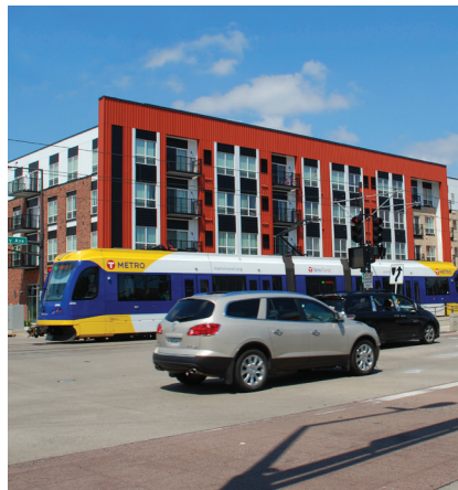
Hamline Station: Workforce housing with first floor retail at Hamline Avenue Station