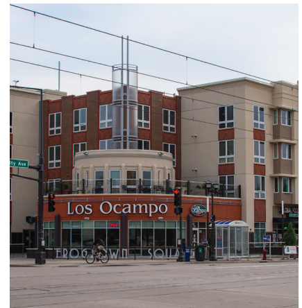
Frogtown Square: Affordable senior living with retail space along University Avenue.