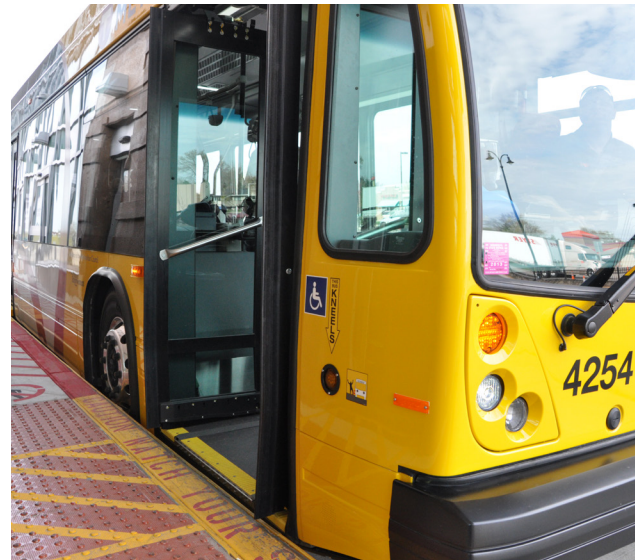
Bus Rapid Transit provides smooth boarding similar to LRT.