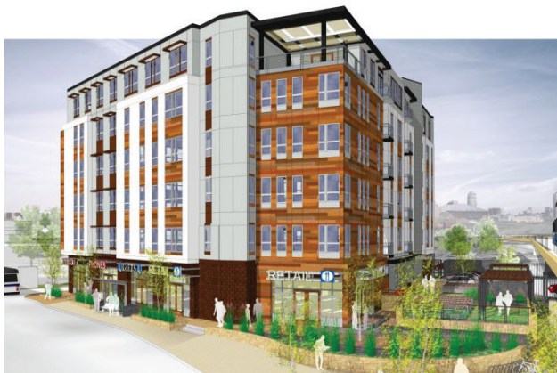
Hi Lake Triangle: Affordable senior housing at Lake Street Station. Image from collegearchitects.com