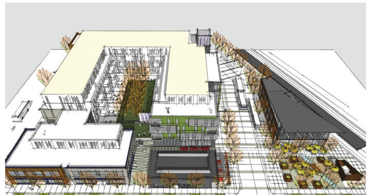
38th Street Station: A mixed use development that improves pedestrian access and public space at 38th Street Station.