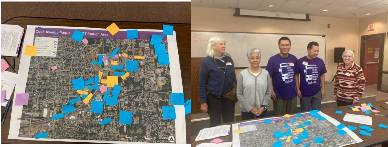
(from left to right) Photo of final asset mapping activity with comments and photo of participants engaging in the asset mapping activity.