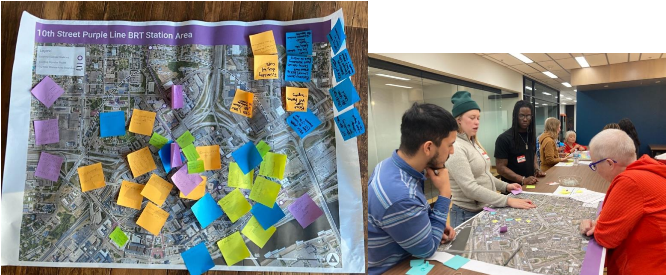
(from left to right) Photo of a completed asset mapping activity and photo of participants completing the asset mapping activity.