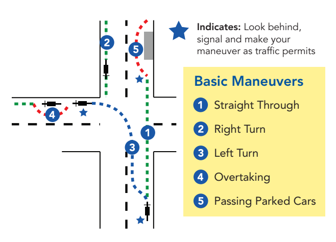
Graphic courtesy of Commuter Connection

The diagram below shows the correct lane positioning for a variety of different scenarios.