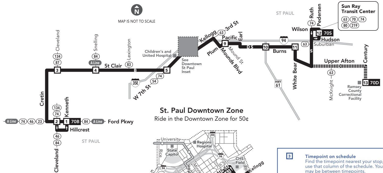
St. Paul Downtown Zone Ride in the Downtown Zone for 50¢