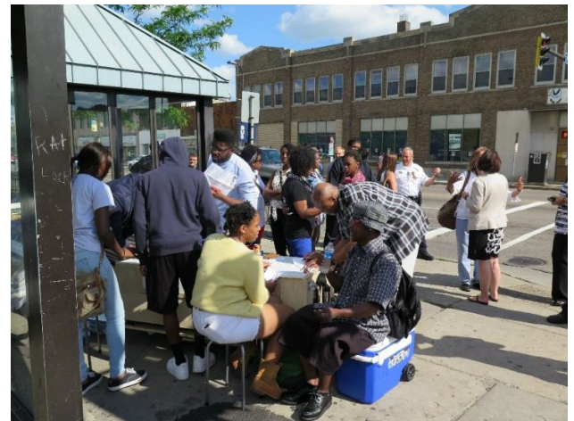
Dadaalka bulshada lagaga qeyb gelinayo waxa uu bilowday bishii Juun 2015 waana sii soconayaa ilaa Diseembar 2015. Dadaalka waxaa ka mid ah in goobaha basasku istaagaan laga hirgeliyo goobo kala duwan ee khadka (kore), suuqa beeraleyda (farmer's markets), wadada Lowry, Habeenka dibad baxa ee heer qaran (National Night Out (below), iyo kuwo kale.