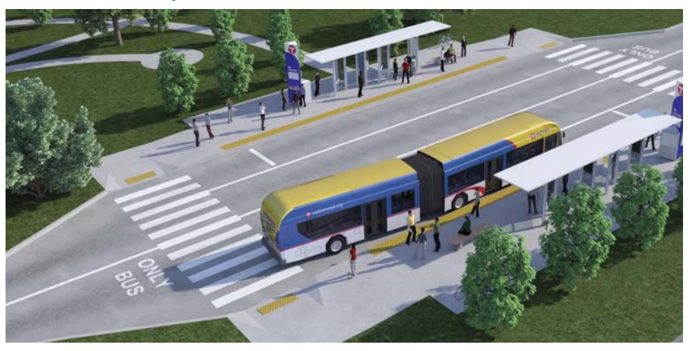
Example of a station