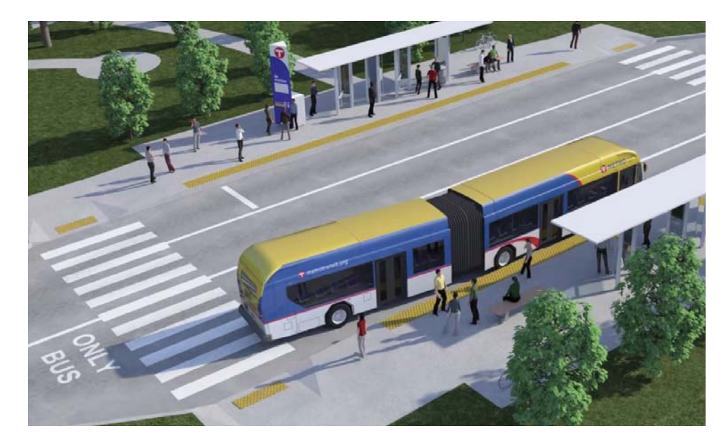
Example of a station