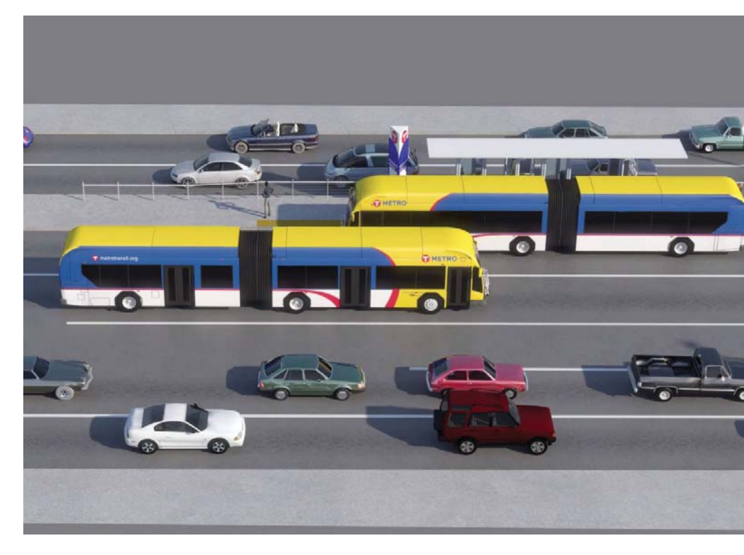
BRT in bus-only lanes