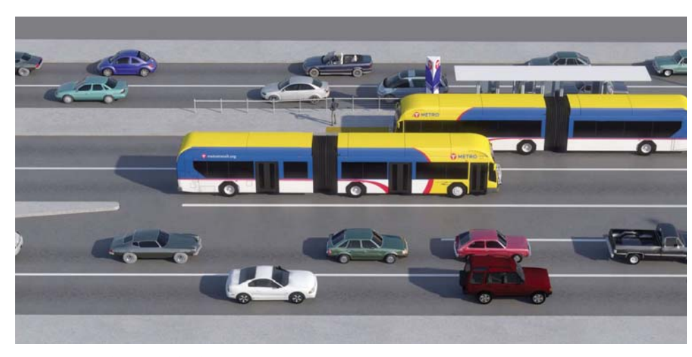
BRT in bus-only lanes

elizabeth.jones@metrotransit.org 651-602-1977