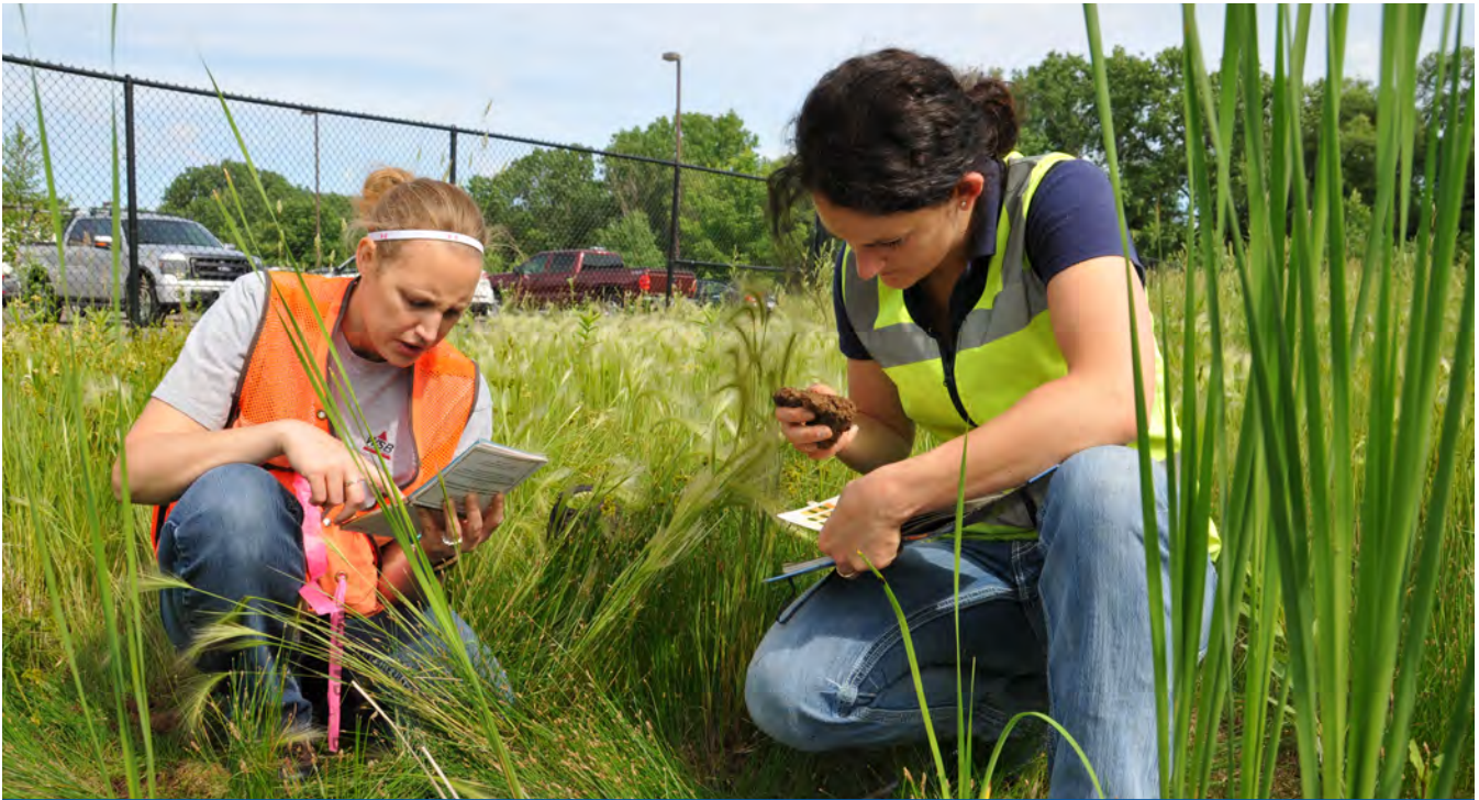
Environmental soil samples

All comments received will be submitted to the Federal Transit Administration (FTA) and the Metropolitan Council, the lead federal and local agencies for the METRO Gold Line project.