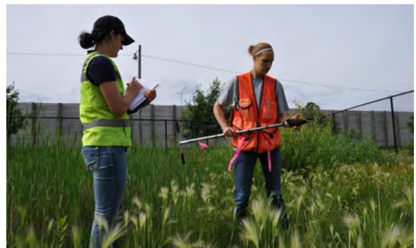
Wetland field walk