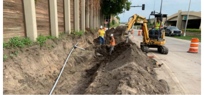
Example of crews placing utility tubes on Orange Line ▲