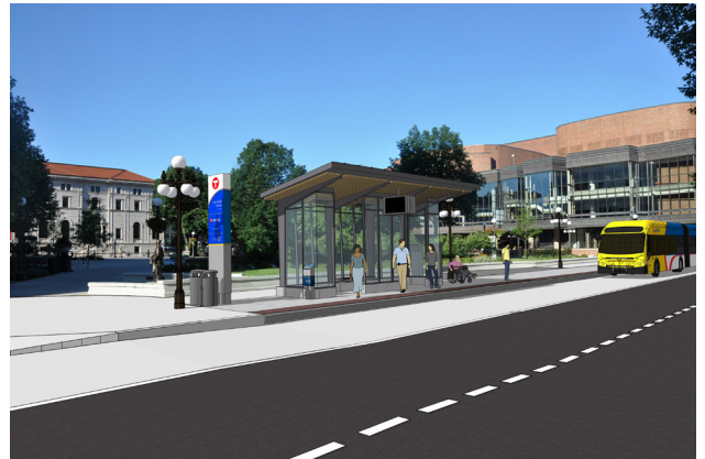
Rice Park Station in downtown St. Paul