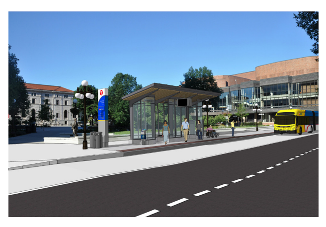
Rice Park Station in downtown St. Paul