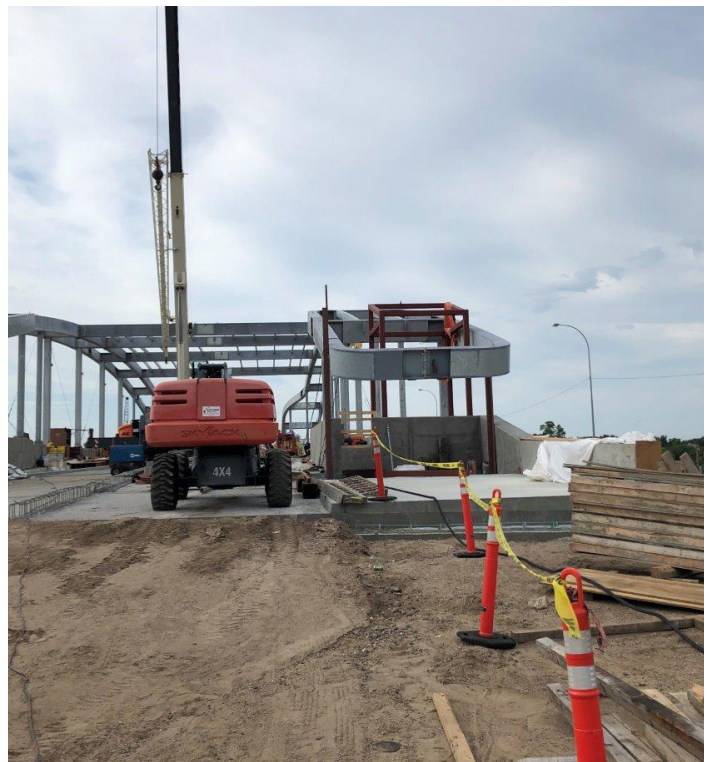
Example of construction