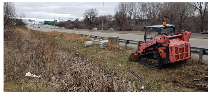
Example of utility work