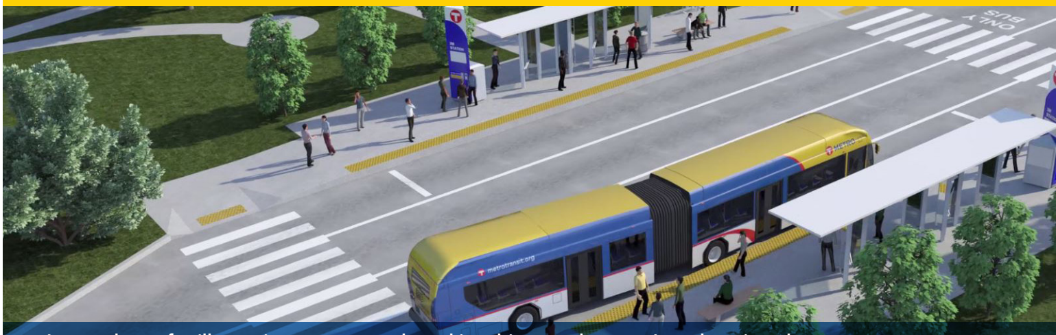
Image shown for illustrative purposes only and is subject to change. Actual station elements may vary.