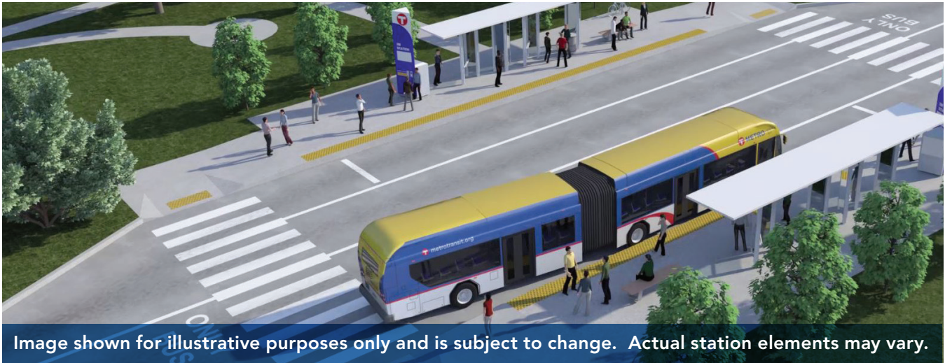
Image shown for illustrative purposes only and is subject to change. Actual station elements may vary.

The Gold Line is one of 17 rapid transitways in a proposed build out of the regional METRO system designed to connect 522,000 people to 310,000 jobs with a commute time of 30 minutes or less*.