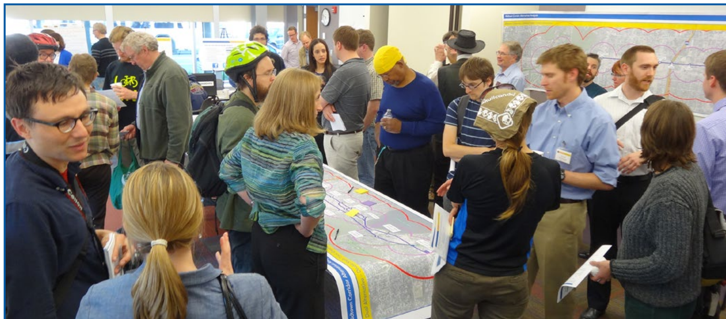
Attendees review the Dual Alternative layout at the May Open House at the Whittier Clinic.

Thank you to everyone who attended the spring open houses! We had a great turnout both nights and received very informative feedback. If you haven't seen it already, the summary of your comments is available at our project website, http://www.metrotransit.org/meetings-and-events .