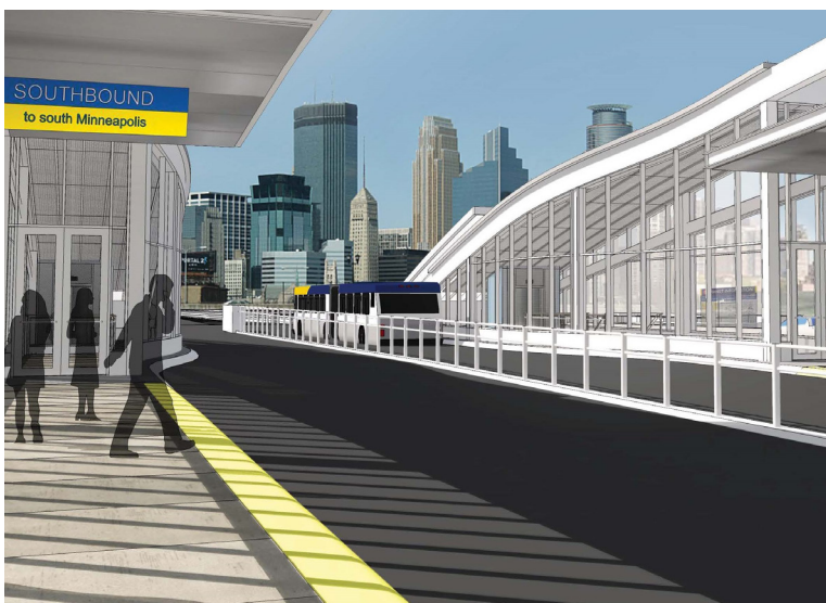
Planned Lake Street Station